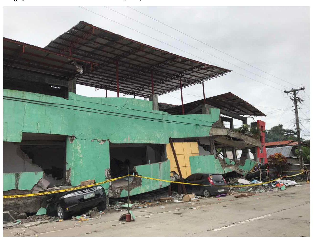
Photo 2. The 3-storey pension house that collapsed in the town of Kananga.

adjacent barangays have also suffered major damage, which includes Barangays Gaas, Dolores, Tongonan, Cabintan, and Mahayag. In Barangay Danao, where upland Lake Danao sits, the barangay road has been noted to have split up.