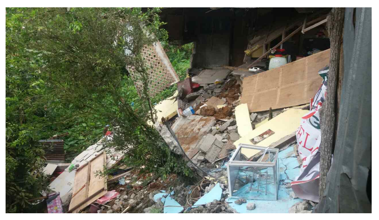
Photo 4. Damaged house in Brgy. Danao, Ormoc City.