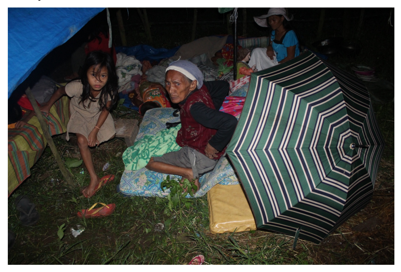
Displaced families in Brgy. Milagro, Ormoc City, Leyte.