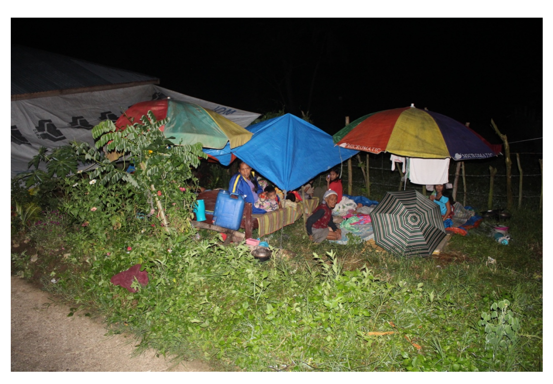
Photo 5. A family camps out on the open space near their collapsed house in Ormoc City.

Widespread power outage is being experienced by the island because the main source of power, the Tongonan Geothermal Power Plant suffered extensive damage. The provinces of Samar, Cebu and Bohol are also suffering blackouts because they also sourced their power from