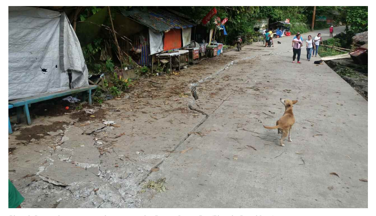
Photo 3. Big cracks are seen on a barangay road in Danay, Ormoc City