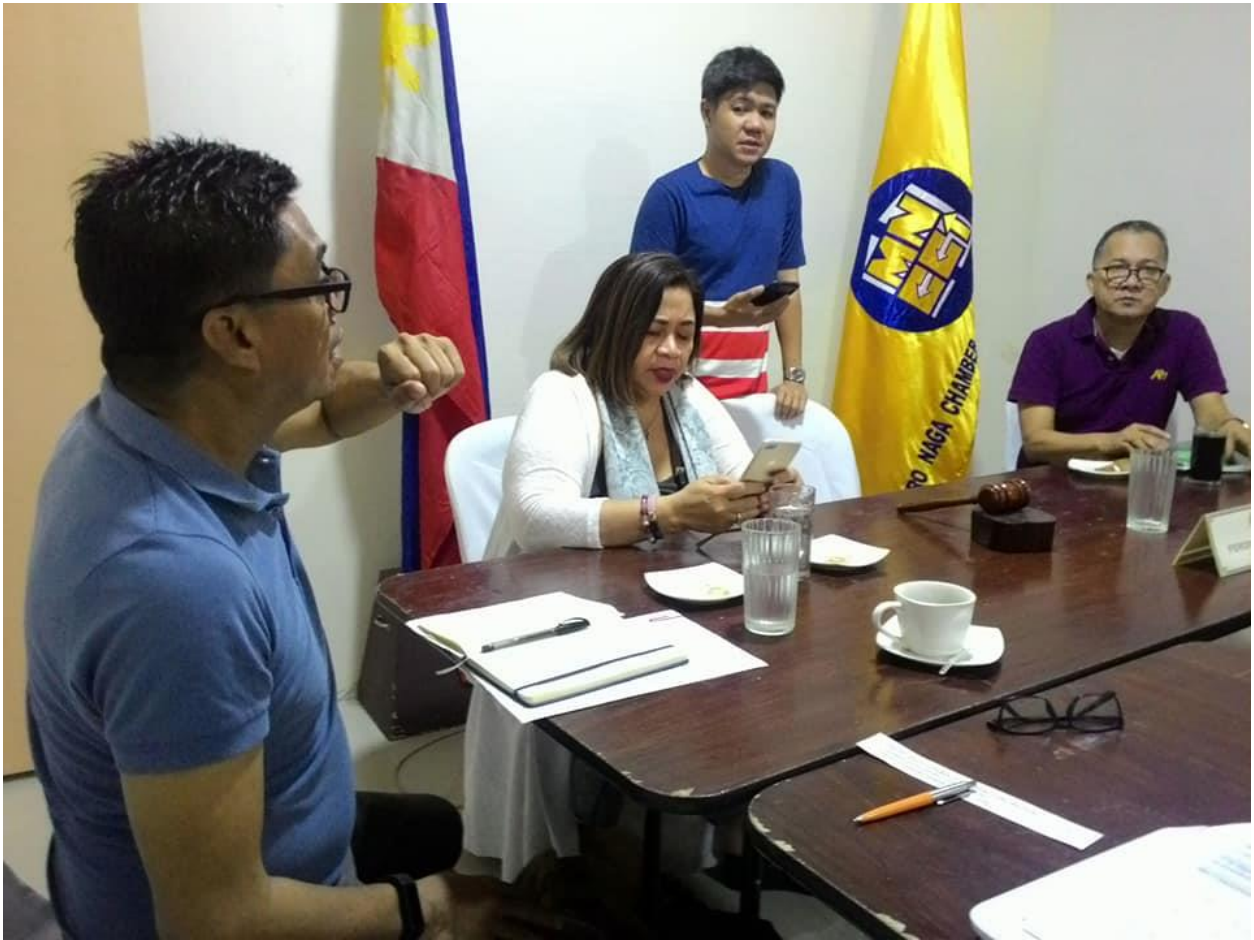
Figure 6 A-PAD Metro Naga convenes to discuss the "A-PAD for Mayon" emergency response