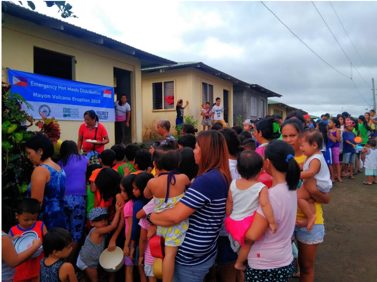
Figure 5 Community Kitchen and Hot Meals Delivery is supported by Mercy Relief and Citizens' Disaster Response Center.