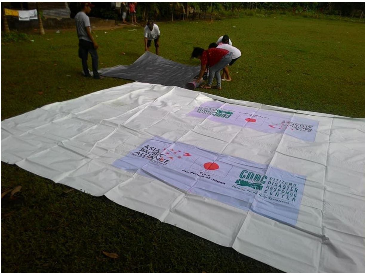
Figure 3 Plastic sheets from A-PAD distributed to evacuees. The Disaster Preparedness Committee (TABI-DPC)