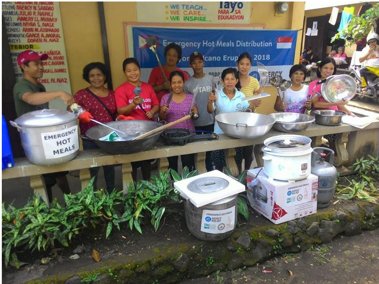
Figure 4 TABI Disaster Preparedness Committee (DPC) of Brgy. Tumpa, Camalig temporarily staying at Taladong ES thankfully receives the Hot Meals kitchen utensils from Mercy Relief thru CDRC.