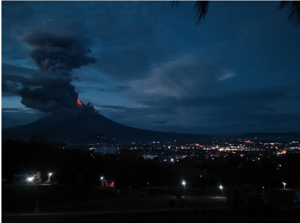
Figure 1 Mayon eruption, Jan. 23, 2018 at 6pm