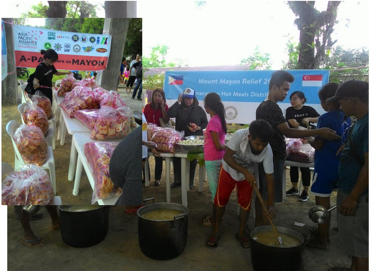
Figure 7 A collaboration of different stakeholders for a more efficient service delivery