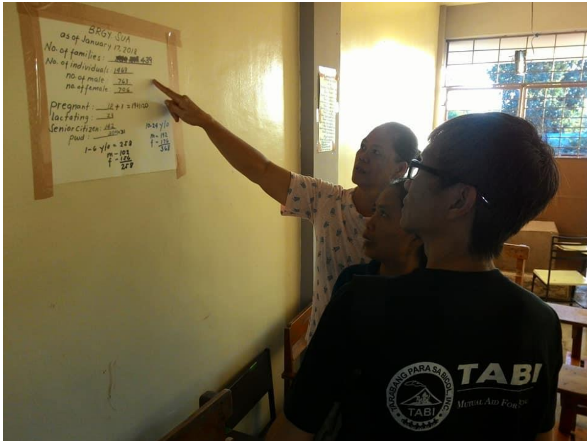
Figure 2 TABI staff conducting rapid assessment