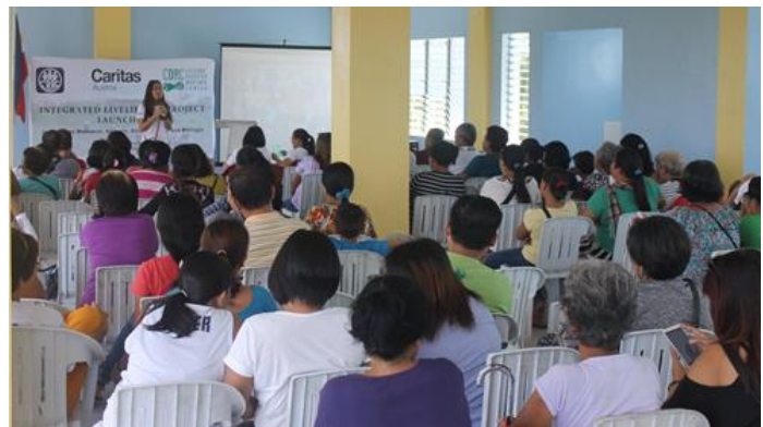
Official launch in Medellin, Cebu on March 16

Livelihood projects supported by Caritas: Caritas Austria supports a two-year Livelihood Project in Cebu and Negros Occidental, which started on Dec. 1, 2017 and will end on Nov. 30, 2019. Implementing partners are Center for People's Resources and