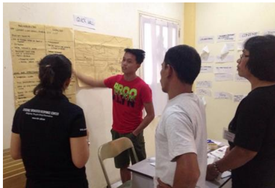
TOT on CCA-DRR, Jan. 24-26, Mindanao