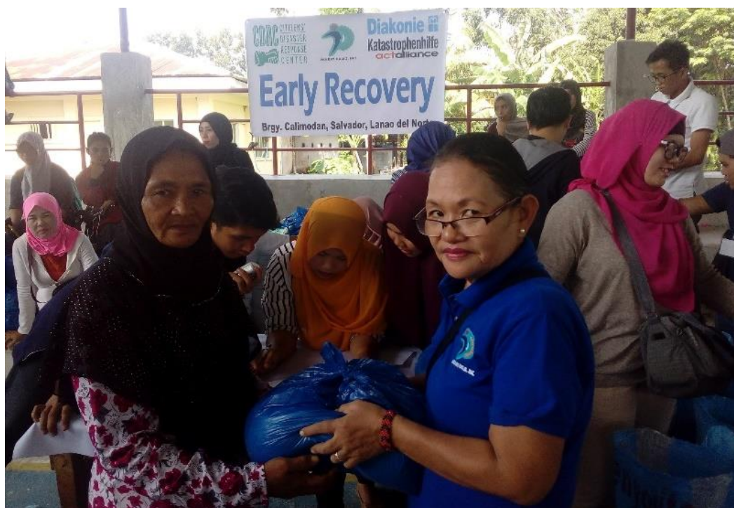
Rice distribution for typhoon Vinta survivors in Lanao del Norte, March 14-15

This is part of the early recovery assistance from Diakonie Katastrophenhilfe (DKH) to Typhoon Urduja and Typhoon Vinta-hit communities in Visayas and Mindanao. Implementing partners are Leyte Center for Development, Inc. (LCDE), Panday Bulig, Kadait and Mindanao Interfaith Services Foundation, Inc. (MISFI). A total of 685 Urduja-affected families and 900 Vinta-hit families will receive cash assistance that will enable them to purchase food, seeds, kitchen utensils, farm tools and shelter repair materials to expedite their recovery.