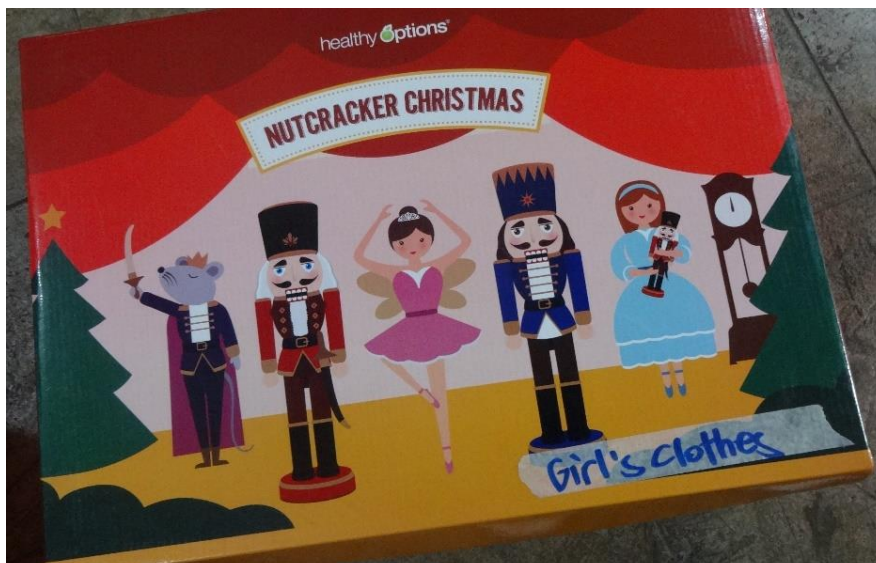
Donated [sorted] pre-loved clothes as an initial result of engagement with Healthy Options