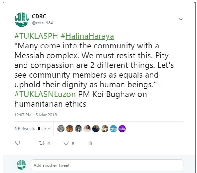
Twitter post on activity highlights