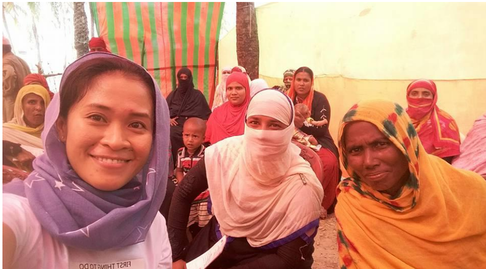
CDRC staff with Rohingya refugees at the Matarbari Community Clinic, March 7

https://www.facebook.com/AsiaPacificAlliance/videos/2037899353117748/UzpfSTIzMtkwNDUwMDYxMT0xMDE2MDAzODkyMDgwNTYxMg/