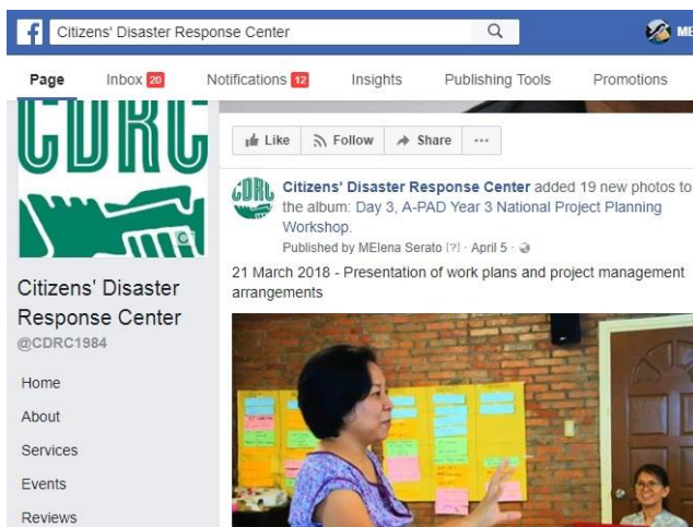
FB Page post on CDRC activities

Regular updates on CDRC/N activities, photos, news, articles, situation reports and information on DRR and CCA (9) were posted on CDRC website, FB Page, Twitter and Instagram accounts.