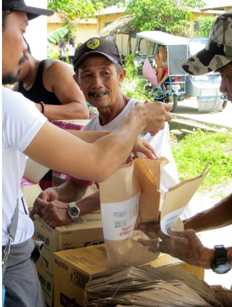
Hygiene kit distribution from DKH, Feb. 7

Emergency Relief Assistance Fund (ERAF) for Mayon Response: Distribution of hygiene kits to 436 families from Brgy. Bañadero who sought refuge at a relocation site in Brgy. Anislag, Daraga, Albay in Bicol and 258 families from Barangay Upper Cabangan in partnership with DKH and CARE Philippines.