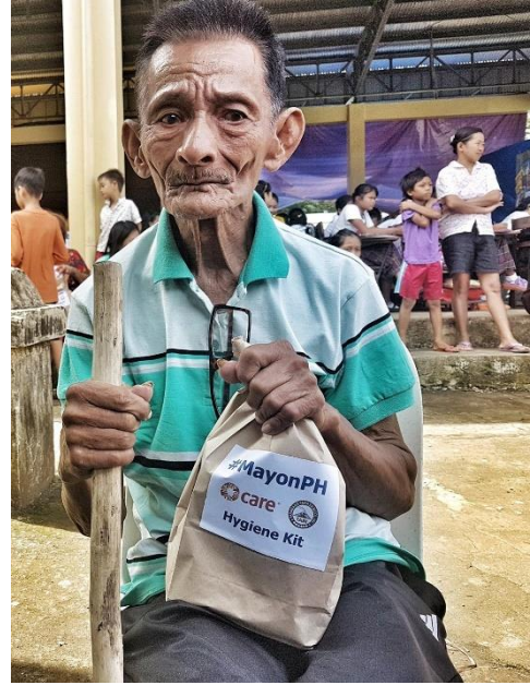
An elderly receives a hygiene kit from CARE Phils, Jan. 31