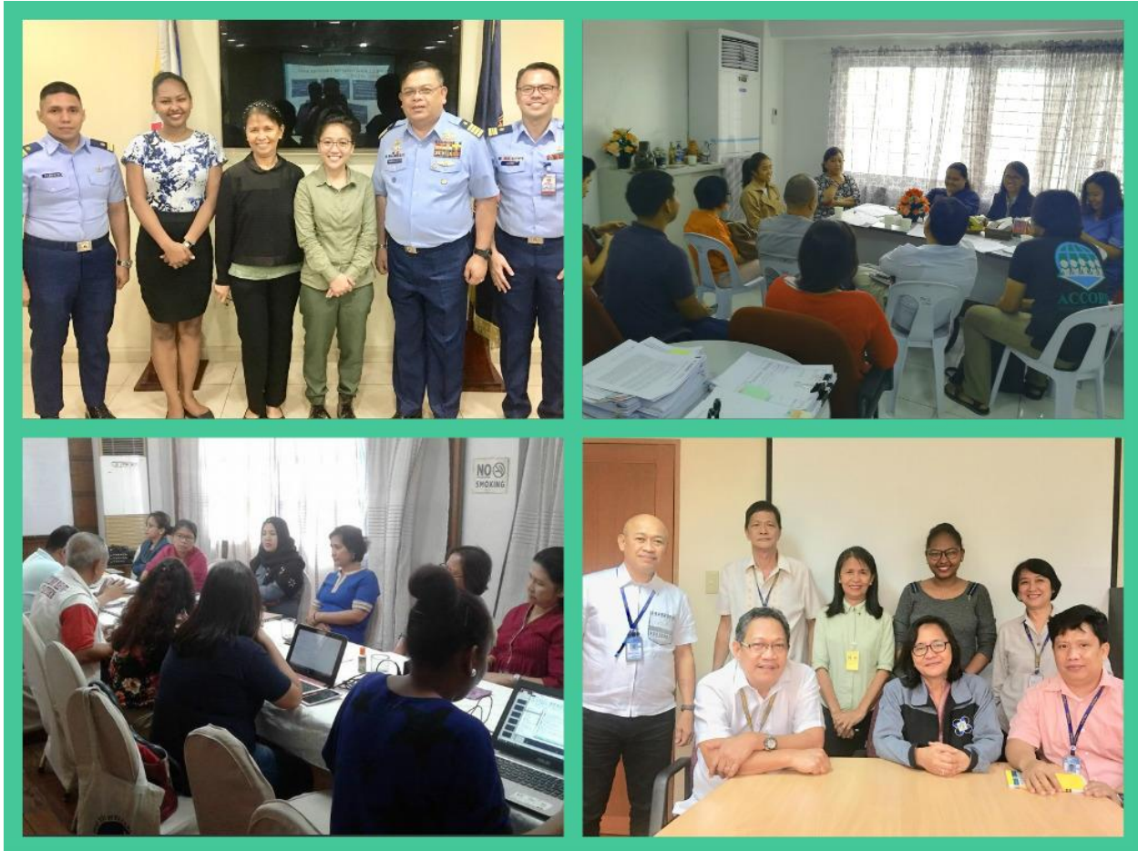
DRRNet consultation meetings with the Philippine Coast Guard, Office of Civil Defense, and weather Bureau PAGASA

DRRNetPhils: As one of the 11 conveners of the Disaster Risk Reduction Network Philippines, CDRC attends the monthly conveners meetings, chairs the Networking and Partnership Committee, and represents the network in the UN-led Humanitarian Country Team as a regular member and the Philippine INGO Network (PINGON) as an observer member.